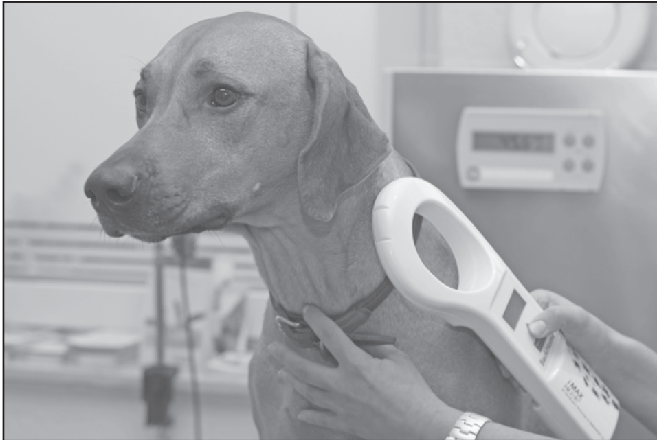
A Dog Being Scanned for a Microchip